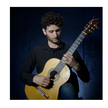
LECTURE Thursday, February 22 11:00 a.m.

He has participated in several interdisciplinary projects and groups funded by the Institute for Advanced Study, such as Improvising Ecosystems (2016-2017), and 5×5 interdisciplinary group Forms and Transmutations (2017) together with prominent professors from the University of Minnesota.