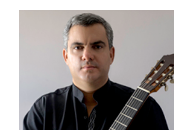
CONCERT Thursday, February 22 4:00 p.m.