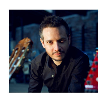
CONCERT Saturday, February 24 4:00 p.m.

As a soloist, he explores a Contemporary Music repertoire combining classical and electric guitars, live electronics, samplers, loopers, and computers. He is also a demanded Guitar performer for renowned Contemporary Music Ensembles such as 2E2M, Mezwej, or Variances, and for various and numerous Chamber Music formations: with cello, violin, flute, voice, chamber and symphony orchestra.