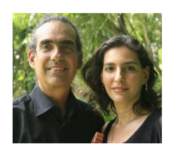
CONCERT Sunday, February 25 7:30 p.m.

COMPOSERS PANEL Sunday, February 25 1:15 p.m.