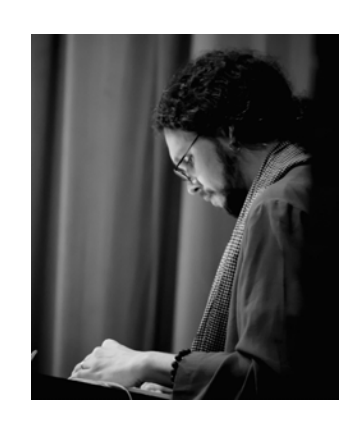
COMPOSITION COMPETITION JUDGE

COMPOSERS PANEL Sunday, February 26 1:00 p.m.