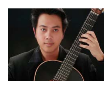
CONCERT Tuesday, February 20 4:00 p.m.