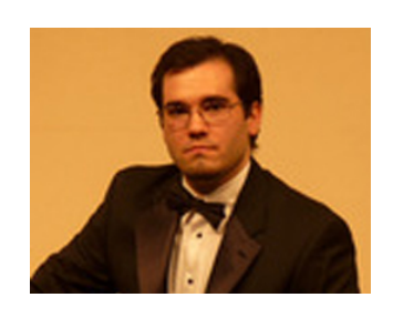
CONCERT Monday, February 19 7:30 p.m.

2018 MIAMI INTERNATIONAL GUITART FESTIVAL