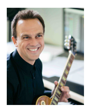
CONCERT Friday, February 23 7:30 p.m.

2018 MIAMI INTERNATIONAL GUITART FESTIVAL