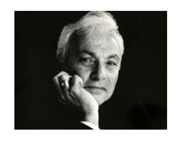
CONCERT Monday, February 19 7:30 p.m.

2018 MIAMI INTERNATIONAL GUITART FESTIVAL