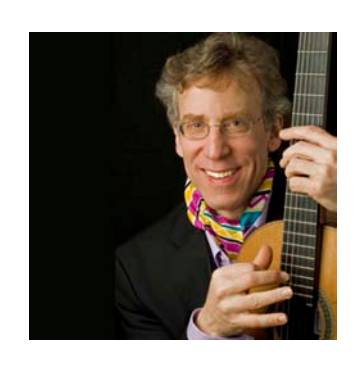
CONCERT Thursday, February 22 7:30 p.m.

2018 MIAMI INTERNATIONAL GUITART FESTIVAL