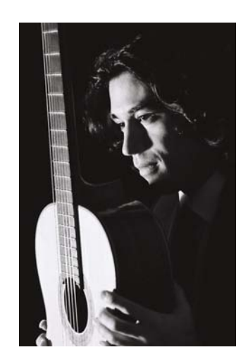
CONCERT Monday, February 19 7:30 p.m.

2018 MIAMI INTERNATIONAL GUITART FESTIVAL