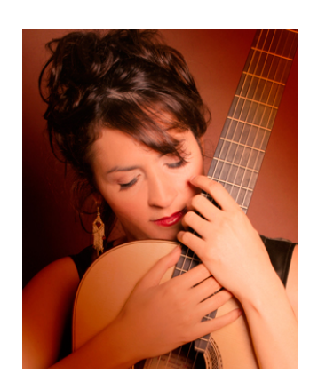
CONCERT Friday, February 23 7:30 p.m.

2018 MIAMI INTERNATIONAL GUITART FESTIVAL